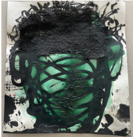
Frédéric Amat — Amatropos #26, 2015