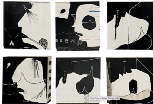
Tim Fite — Swan Songs 1-9

The Faces II exhibition will be available for view at Hal Bromm Gallery until March 2023.