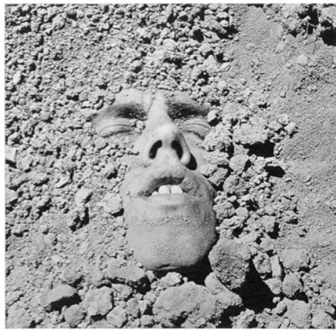
David Wojnarowicz — Untitled (Face in Dirt), 1992-93