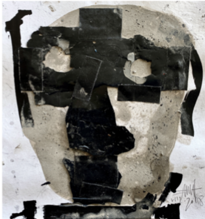
Frédéric Amat — Papers de cendra, 2018