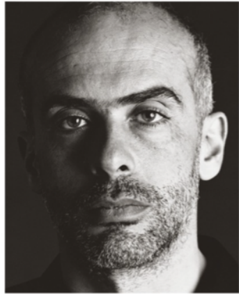
Timothy Greenfield-Sanders — Francesco Clemente, 1987